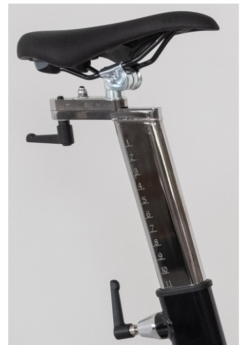
Height-adjustable seat post with rail notch indicators allows unlimited height settings

Use your own saddle, handlebars, pedals, or choose among different options; including a handlebar with gear shifters and sprint button, longer adjustable seat post, adjustable handlebar and mountain bike handlebars.