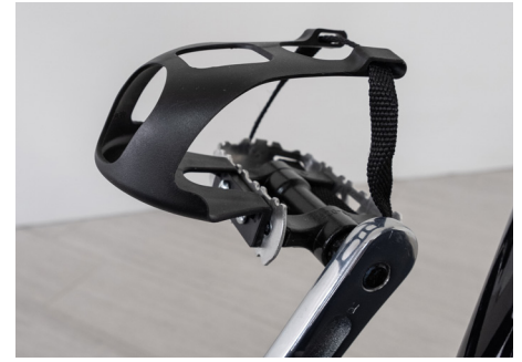
Standard combi SPD pedals with toe clip cage design