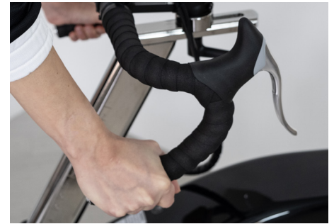
Drop bar handlebars designed for a true racing position