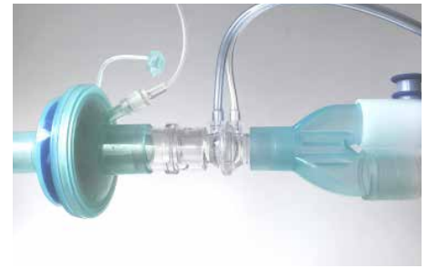
The Ventilator patient circuit requires the use of a single-use flowmeter and HME or standard filter

Face Mask Mode. REE measurements can be performed using an oronasal face mask on spontaneously breathing subjects whenever Canopy Hood cannot be used (special subjects, claustrophobic, etc.). A flowmeter and a sampling line are connected to the mask (5 sizes) for VO 2 and VCO 2 measurement