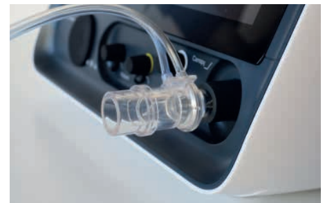
COSMED single-use pneumotach flowmeter (Flow-REE)