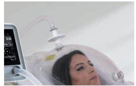
Canopy Hood (small or large size) utilizes a single-use veil to avoid cross contamination