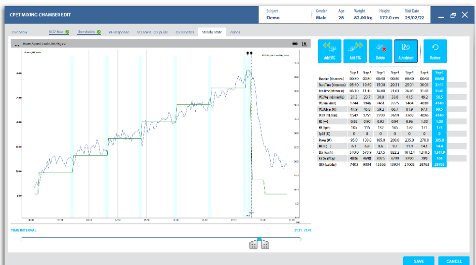
Automatic steady state identification