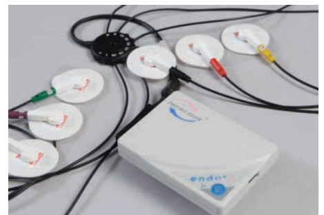
Cardiac Output monitor (Physioflow®)