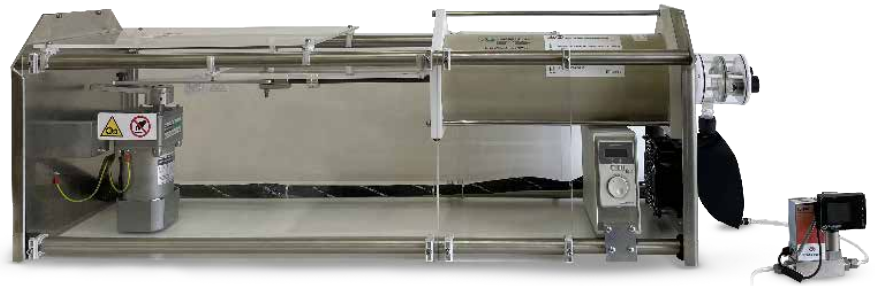
COSMED Metabolic Simulator is an advanced verification tool to simulate human subject gas exchange and respiratory pattern for both clinical and research settings