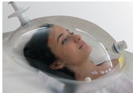
REE by dilution with canopy hood