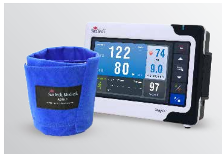
Blood Pressure Monitor (Tango®)