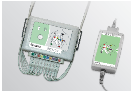
COSMED C12x/T12x ECGs (wireless or patient cable)