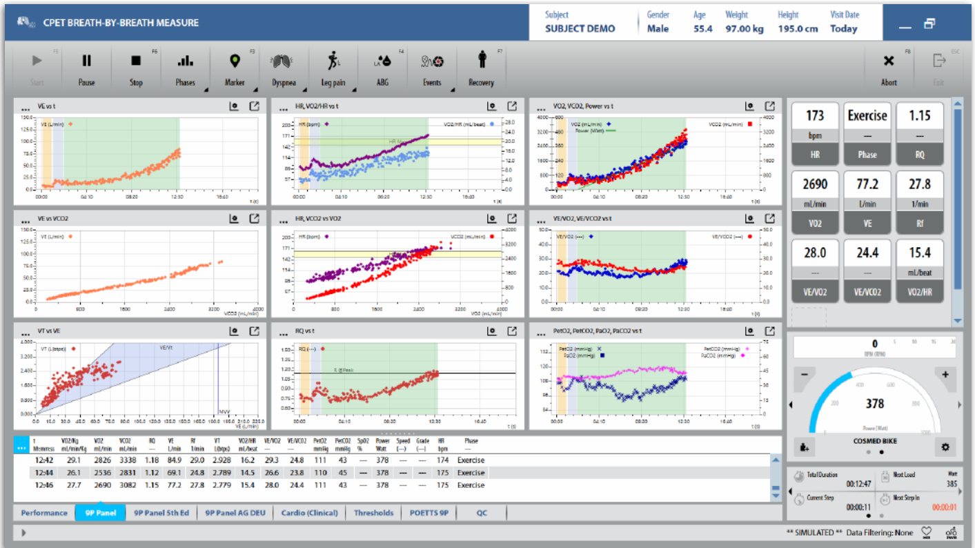
Possibility to manage/display in real time data and plots via dashboards (default and user defined)