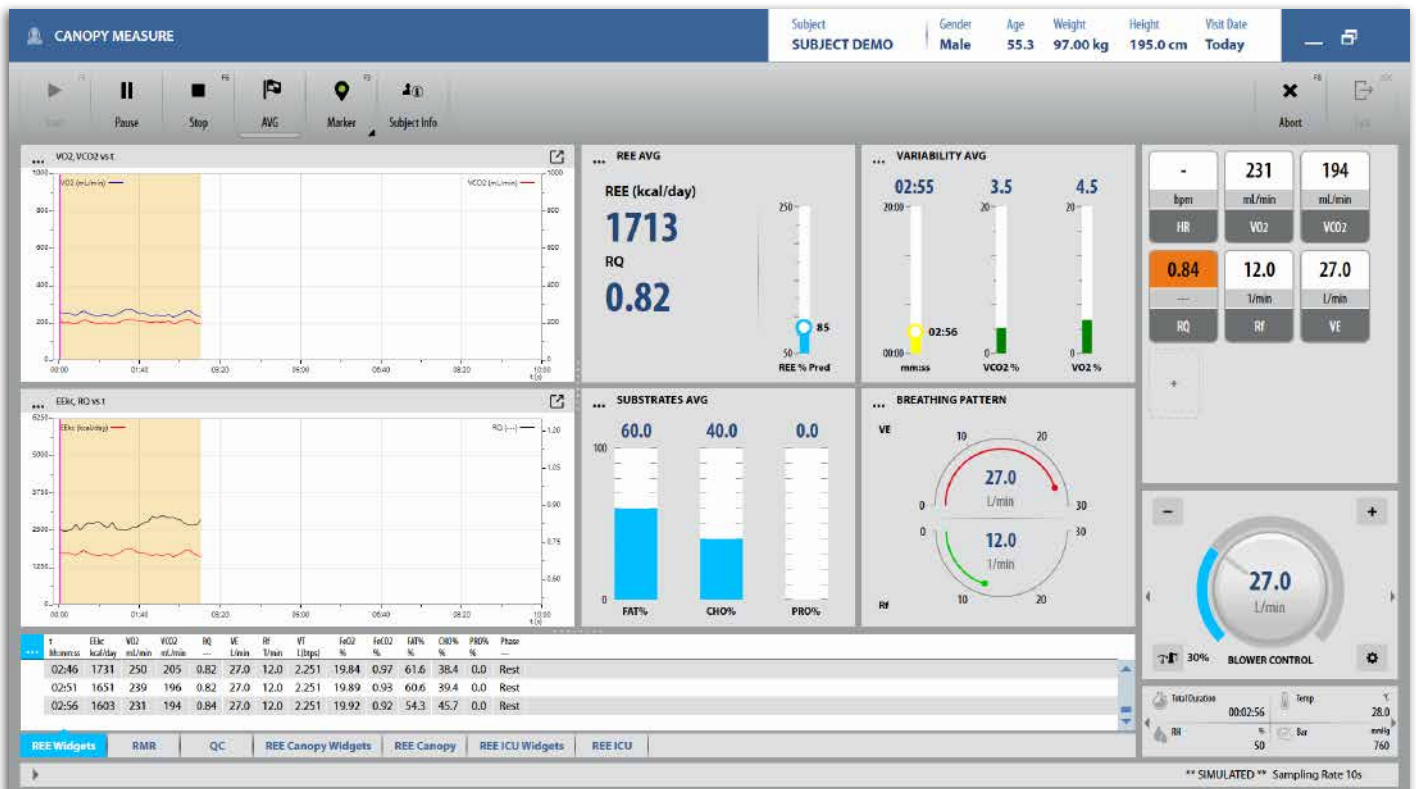
REE test real-time panel including graphs, tabular data and widgets for quick results interpretation